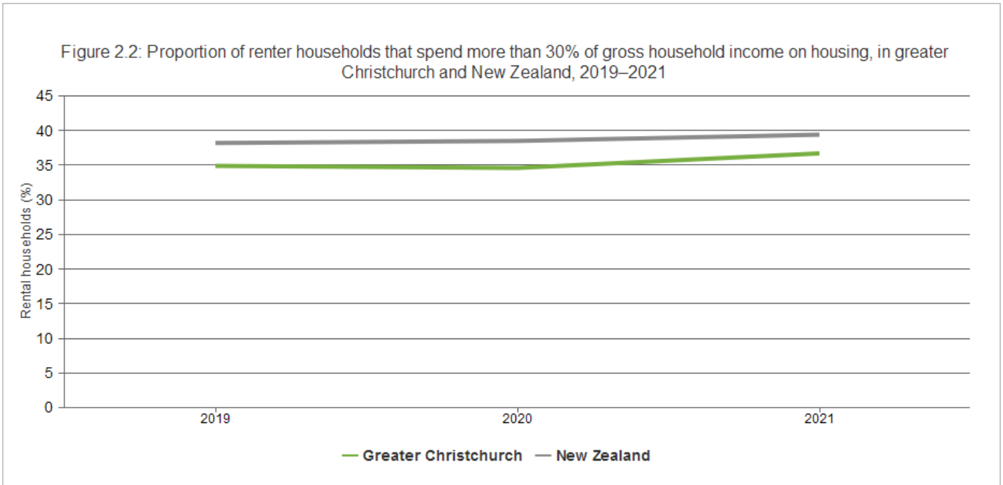
Figure 2.2: Proportion of renter households that spend more than 30% of gross household income on housing, in greater Christchurch and New Zealand, 2019–2021

The figure shows that the proportion of renter households in greater Christchurch spending over 30 percent of their gross household income on housing costs was relatively stable between 2019 and 2021 (34.6 percent in 2019, 36.7 percent in 2021). By this measure, for the period 2019 to 2021, spending on rental housing has generally been lower for greater Christchurch renters compared with renters in New Zealand overall.