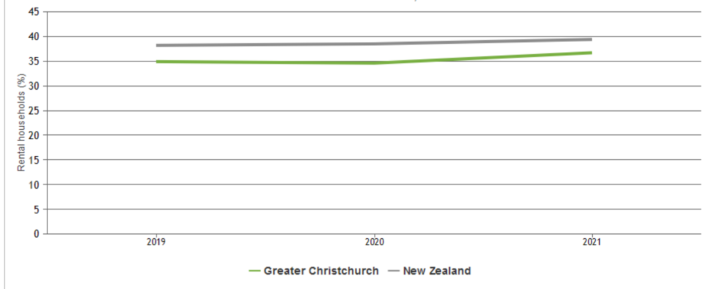
Figure 2.2: Proportion of renter households that spend more than 30% of gross household income on housing, in greater Christchurch and New Zealand, 2019–2021

The figure shows that the proportion of renter households in greater Christchurch spending over 30 percent of their gross household income on housing costs was relatively stable between 2019 and 2021 (34.6 percent in 2019, 36.7 percent in 2021). By this measure, for the period 2019 to 2021, spending on rental housing has generally been lower for greater Christchurch renters compared with renters in New Zealand overall.